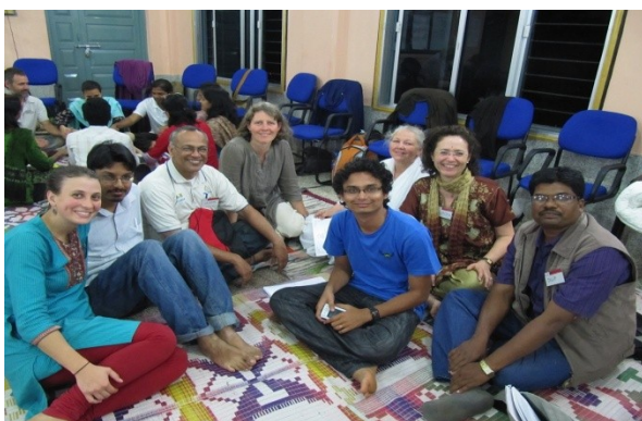
(Participation in Non violence Communication convention in international level)

The study has been a tool for resolving the land issue in the area. It has been studied well the mind and attitude of different categories of people with regard to the land issues. There were many significant strategies found during the studies to address the issues such as people want to resolve the land issue in non- violent way. They want the issue can be resolved by the interference of district or state administration, by legal process in the court also by interference of local leaders, NGOs and grass root level elected representatives. These strategies can be adopted in addressing the land conflict issues in different area. Hopeful, this study will be helpful in resolving the land issues to a greater extent.